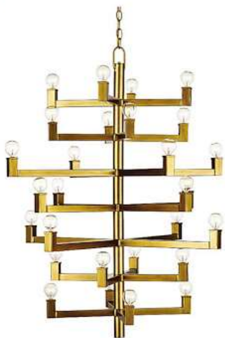
Currey & Company's Andre chandelier is made of wrought iron in a brass finish catering to both contemporary and transitional styles. Atlanta, Las Vegas

! TREND ALERT: Lighting with multiple circular bulbs is a trend.