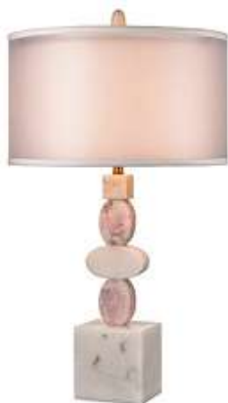
Elk Home's Audrey table lamp features a vertical stack of rounded white and pink stones on a cube of marble-finished stone. Atlanta, Las Vegas

Don't forget to look up when shopping around market. The latest lighting intros are sure to please with never-before-seen designs, branching arms, pops of gold, glass spheres and abstract shapes.