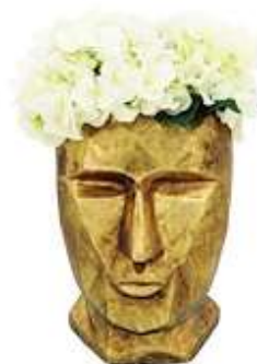
Sagebrook Home's Face vase is made of resin and is 17" high. Atlanta, Las Vegas