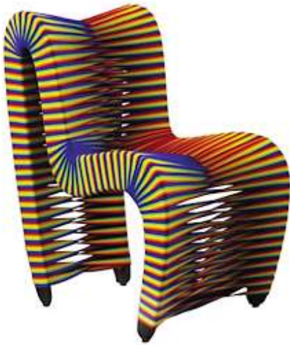
Phillips Collection's Seatbelt chair is a limited-edition piece showcasing vibrant colors to honor equality and diversity. Las Vegas