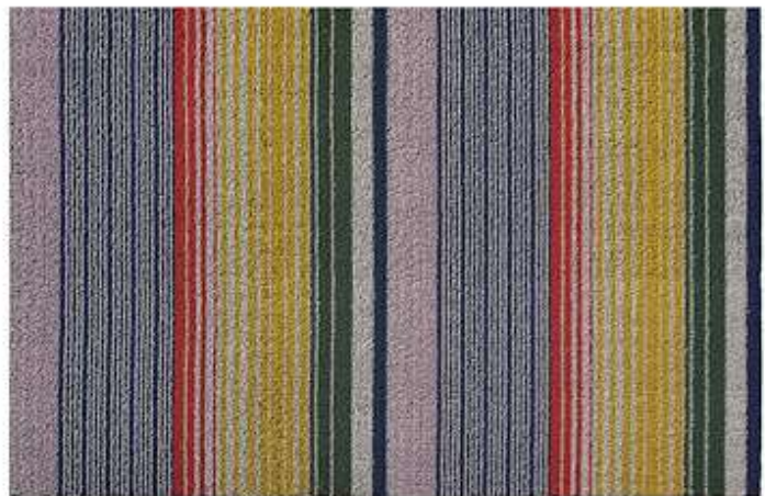
Chilewich's Pop stripe shag mat has bands of color and is available in four sizes. Atlanta, Las Vegas