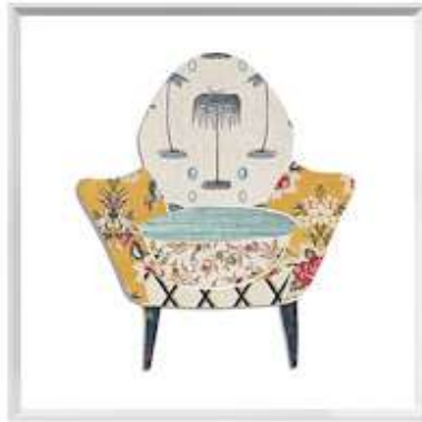
Celadon Art's 'Chaise À Motifs I' is a colorful work of art framed in glass. Las Vegas

Dive into an abundance of color this summer – it is here to stay! From the floor to the walls, color brings positivity and life into the home.