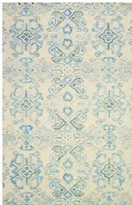
Jaunty's Genesis Collection is hand-tufted using looped wool yarn made in India. Las Vegas

Rugs have upped the ante with an abundance of colors and texture for a soft place to land.