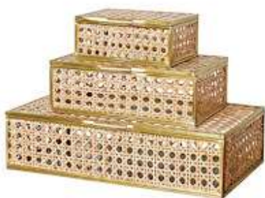
Anaya Home's Cane wicker boxes are made by applying cane wicker onto glass and finishing it with a metal edge. Atlanta, Las Vegas

This season, vases and boxes are major trend items, showing off the latest in multifunctional design.