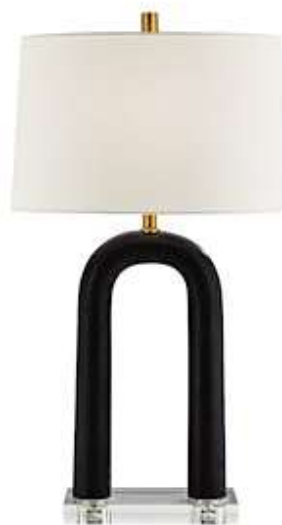
Pacific Coast Lighting's Elie lamp has a resin body with an acrylic base and a white linen oval shade. Las Vegas