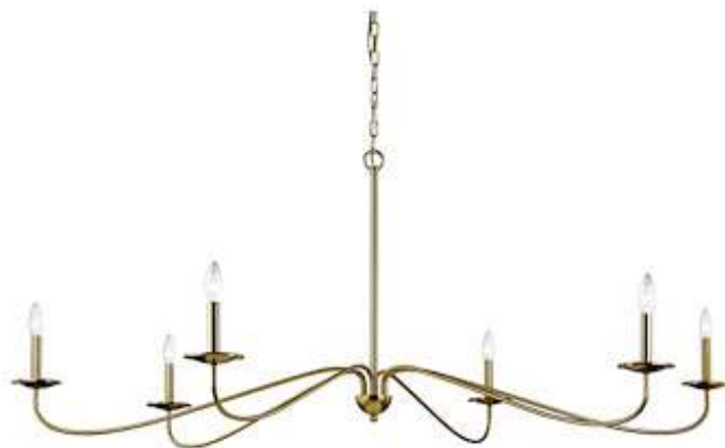
Forty West's Hunter chandelier features six long arms with a gold finish. Las Vegas