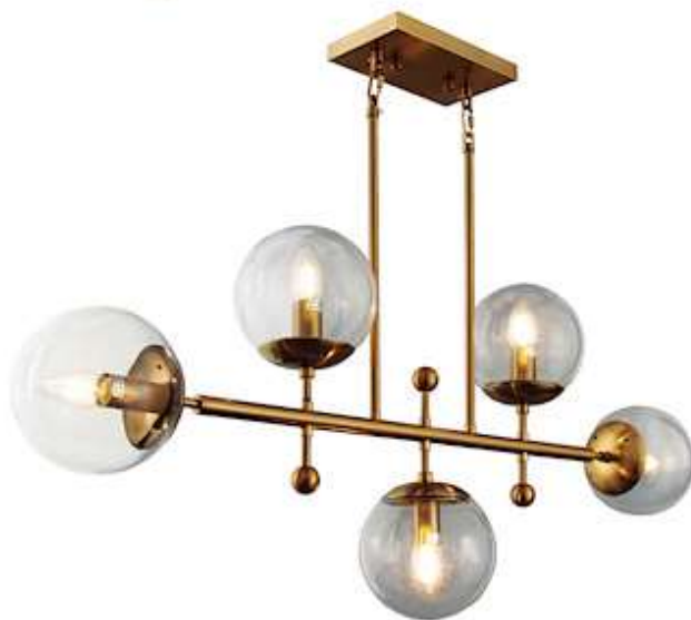
Meva's Giorno pendant is made of iron with a brass finish and five clear orbs. Atlanta

This fixture has a net weight of only six pounds!