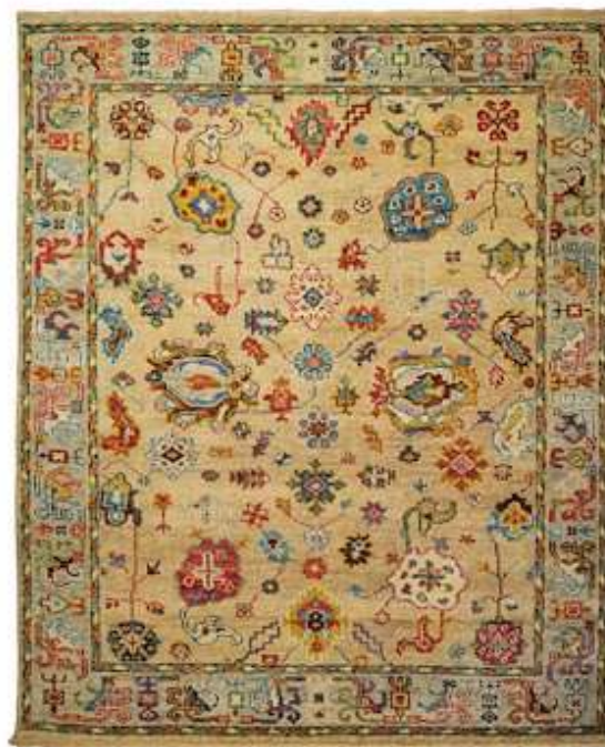
Capel Rug's Verve Collection is hand-knotted in India and made of 100% wool.