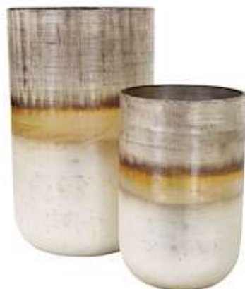
Howard Elliott Collection's clear antique vase showcases transitions of white, gold and antique silver with a crosshatch technique. Las Vegas