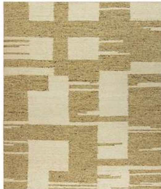
Harounian Rugs International's Arizona Collection is hand-knotted in India of thick, dense-pile wool. Las Vegas