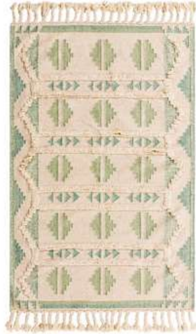
Unique Loom's Mesa Collection rug features geometric tribal patterns inspired by Southwestern designs. Las Vegas