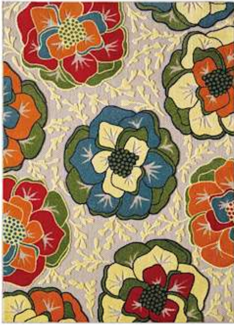
KAS Rugs' Calla Collection features bold patterns machine-woven in Turkey of 100% UV-treated polypropylene. Las Vegas