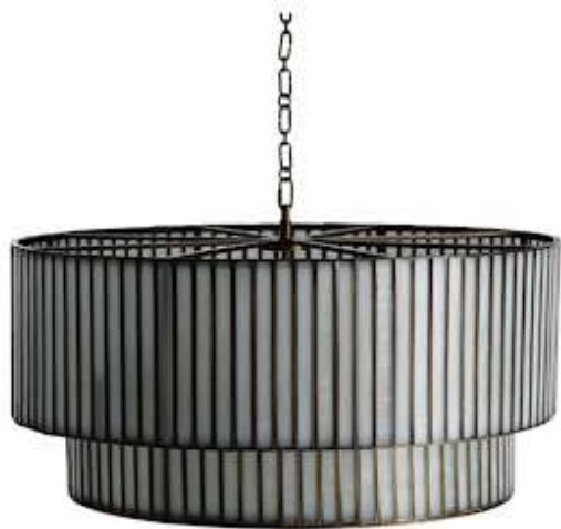
Gabby's Fischer chandelier has a two-tier silhouette made of hand-pieced slivers of milk glass and an antique brushed-brass frame. Las Vegas