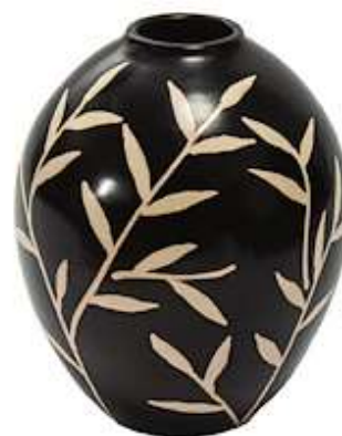
Napa Home & Garden's Dayana large vase is made using a classic batik process that involves smoked mango leaves. Atlanta