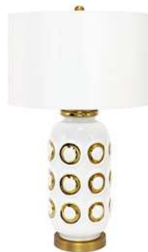
Couture Lamps' Channing table lamp features gold-plated circle designs and a white linen drum shade. Atlanta