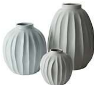
Accent Décor's Astoria ceramic vases feature a classic silhouette and a matte white finish. Atlanta