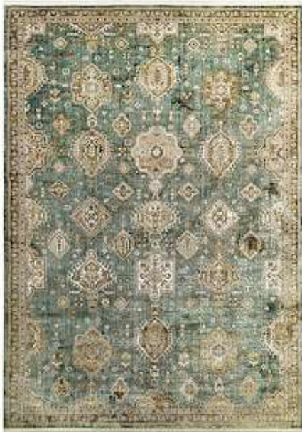
Dynamic Rugs' Ella Collection is machine-made in Turkey of polyester. Las Vegas