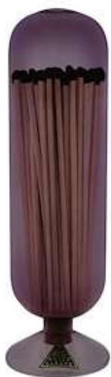
Skeem Design's Jewel fireplace match cloches are made of hand-blown glass and offer a striker strip on the glass. Atlanta