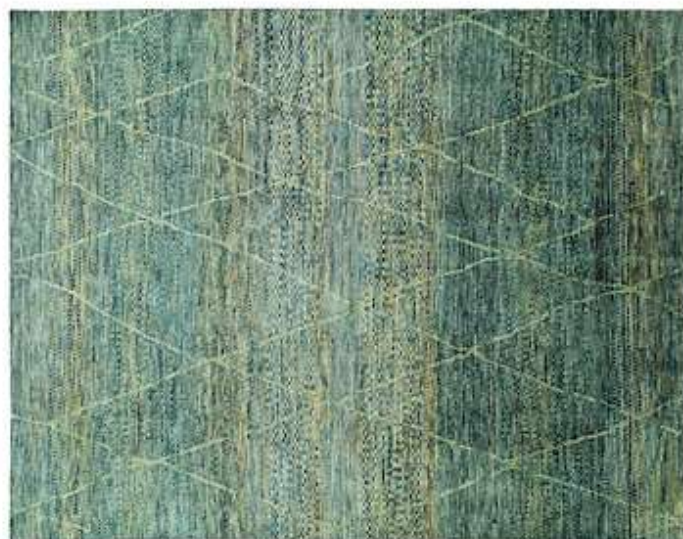
Kaleen's Sikri Collection is hand-knotted from a premium wool and cotton blend in India. Las Vegas