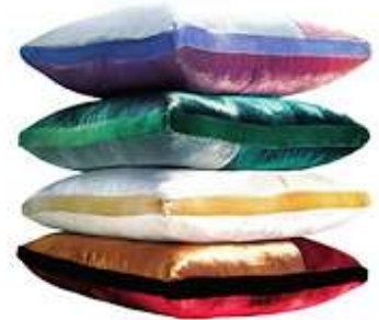
Kevin O'Brien Studio's Color Block velvet pillows have patches of velvet colors placed together for a coordinated pattern. Las Vegas

TREND ALERT: Color-blocking in pillows is a trend you don't want to miss out on