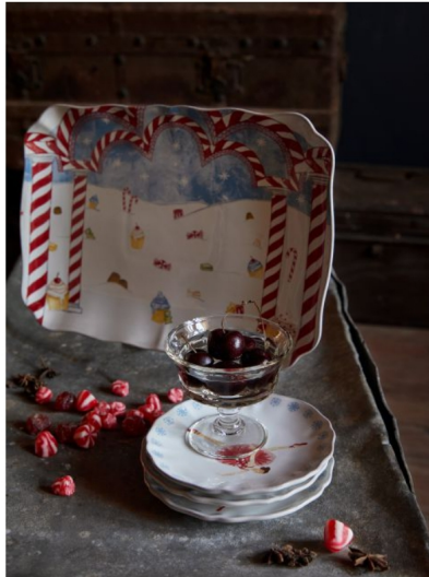
THE NUTCRACKER HOLIDAY COLLECTION ◀ From Casafina Gifts, LV C123 www.casafinagifts.com

Inspired by Hoffman's tale and Tchaikovsky's subsequent ballet, The Nutcracker, Casafina raises the curtain to reveal a stunning selection of must-have items for the festive season.