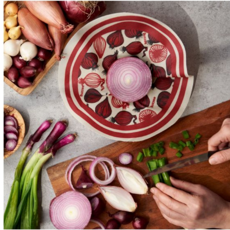
ROUND WRAP ◀ From Buzzee Wraps, LV Temps E-829 www.buzzeewraps.com

The Buzzee Round Wrap is designed for storing most commonly unfinished and leftover food types! Each printed pattern reminds you of what's inside. Simply wrap your leftover produce and then seal with the warmth of your hands. Onion, pepper, citrus, apple and avocado are the most common foods stored in plastic wrap or bags, so making the switch to Buzzee is an easy way for you to make your fridge more eco-friendly!