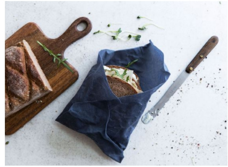
BEESWAX COTTON WRAPS ▲ From Toff & Zürpel www.ameico.com/collections/toff-zurpel

Set of two beeswax covered organic cotton sheets in gift box. Made of bio-cotton, regional organic beeswax, traditional pine resin and fair traded organic coconut oil. The beeswax wrap is the practical, natural and reusable packaging for your food. It replaces aluminum & cling film, plastic & paper packaging as well as bulky lunch boxes and can be used in the fridge or freezer, at home or on the go. Beeswax wraps are water-repellent and flexible. Cover vessels and plates with the cloth, cling to cut fruit and vegetables, wrap salads and herbs, wrap cheese, bread and slices. Use the heat of your hands to mold the wax to the surface you are covering. Do not use to store fish or raw meat.