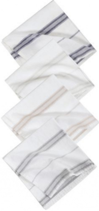
CAMBRIA NAPKINS ◀ Pom Pom At Home, LV C506 www.pompomathome.com

A refined composition of solid brass and charcoal-stained vellum adorn the sweeping profile of the Humphrey Tray. At a sizable scale, the elongated planar handles and subtle curved edge provide the perfect platform for showcasing treasured items or for placing atop a cocktail ottoman. Vellum may vary.