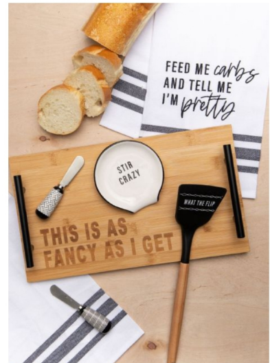
THIS IS AS FANCY AS I GET CHEESE BOARD ▲ From Totalee Gift, LV Showroom C1012 www.totaleegift.com

5 Gourmet Business Las Vegas Market Summer 2021