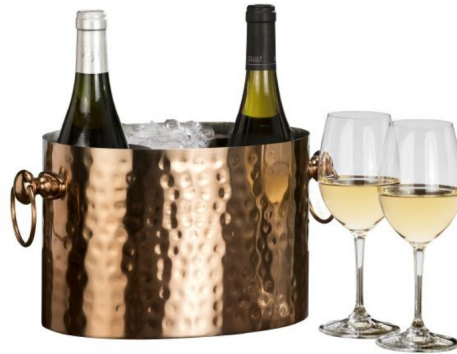
WINE CHILLER ▲ From Chic Chill, LV Temps Booth # 913 www.chic-chill.com

Beautifully display 1, 2 or 3 bottles of your favorite Wine or Champagne and perfectly chilled all evening. Bottles easily slip into the patented aluminum insert without ever touching the ice. The Chic Chill is available in 4 different finishes: Copper, Brass, Stainless Steel and Farmhouse-Rustique. Carefully handcrafted by artisans for the perfect synthesis of beauty and utility.