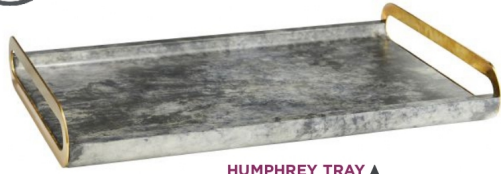
HUMPHREY TRAY ▲ From Arteriors, LV C379 www.arteriorshome.com

A refined composition of solid brass and charcoal-stained vellum adorn the sweeping profile of the Humphrey Tray. At a sizable scale, the elongated planar handles and subtle curved edge provide the perfect platform for showcasing treasured items or for placing atop a cocktail ottoman. Vellum may vary.