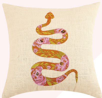
Peking Handicraft | C1055