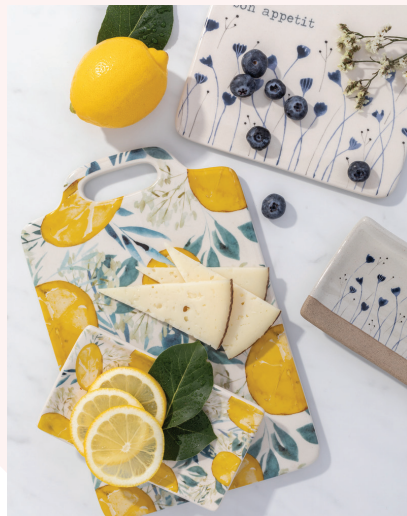
DEMDACO | C996