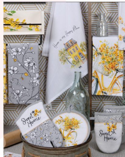
Kay Dee Designs, shown by Next Step Reps | C863, C888, C891