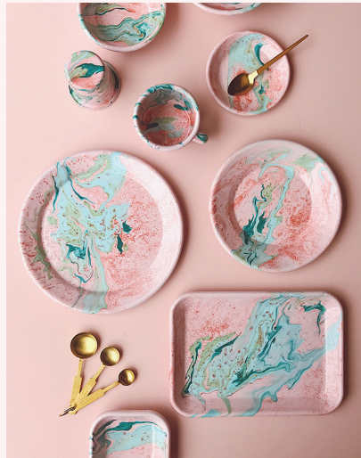
Crow Canyon, shown by Keena | C1035, C1053