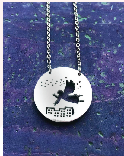
Feifish/Close 2 UR Heart | E-425