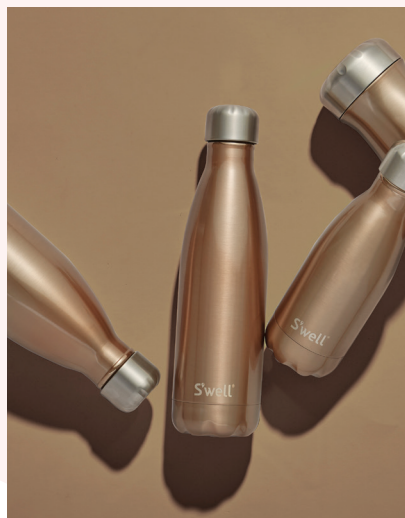
S'well, shown by Keena | C1035, C1053