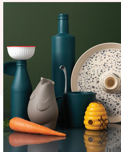
Ototo, shown by Keena | C1035, C1053