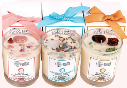
Gifts of Nature | C806