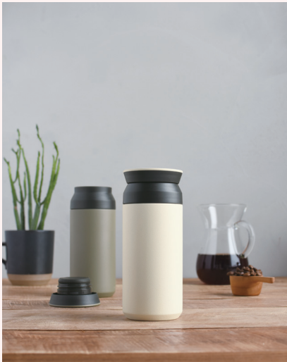
Kinto, shown by Keena | C1035, C1053