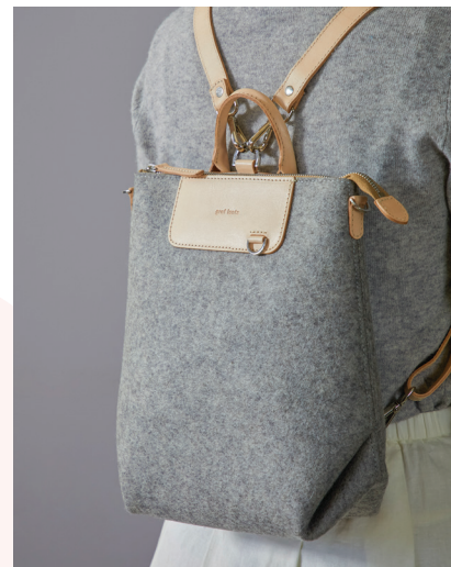
Graf Lantz, shown by Keena | C1035, C1053