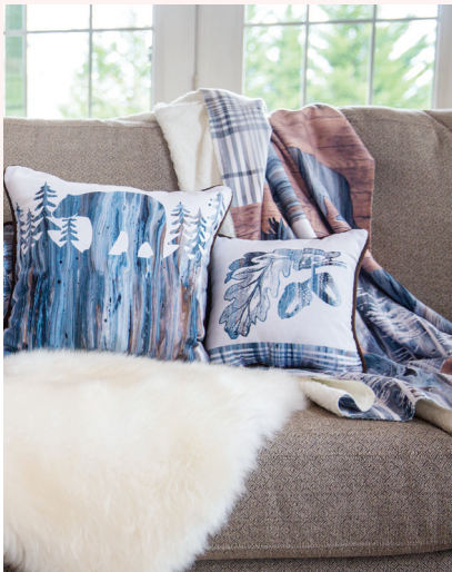
Manual Woodworkers and Weavers, shown by Next Step Reps | C863, C888, C891