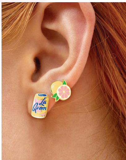
Yellow Owl Workshop, shown by Keena | C1035, C1053