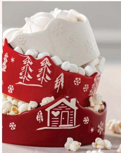
DEMDACO | C996