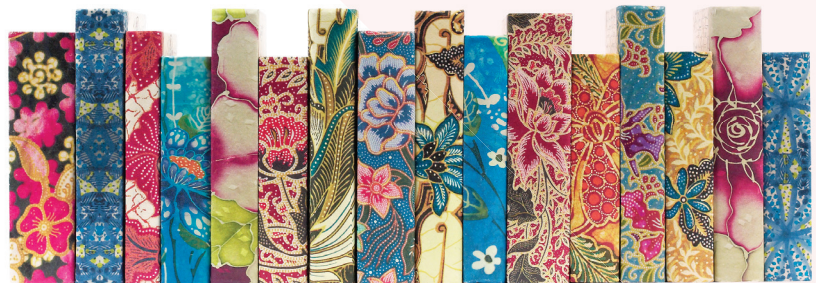
E. Lawrence Ltd. | C587