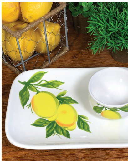
ABBIAMO TUTTO | C109