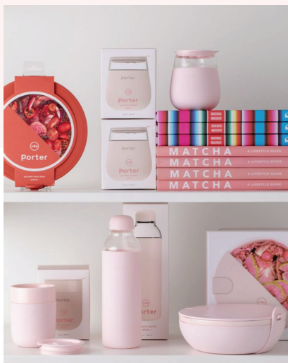
W & P, shown by Keena | C1035, C1053