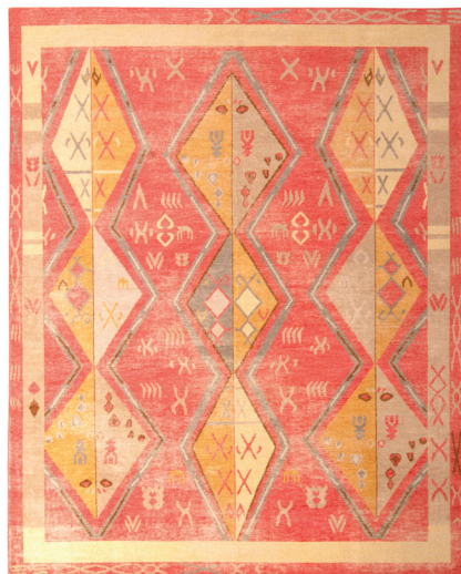
Rug and Kilim | E-1417