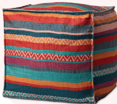
Loloi Rugs | A224-04, B425, B462, B471, B480, B482