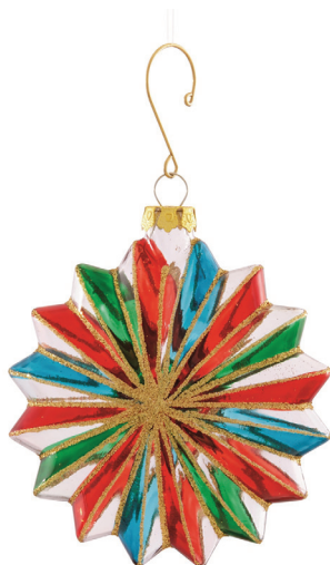
Napa Home and Garden, shown by Ivystone | C676, C684, C696