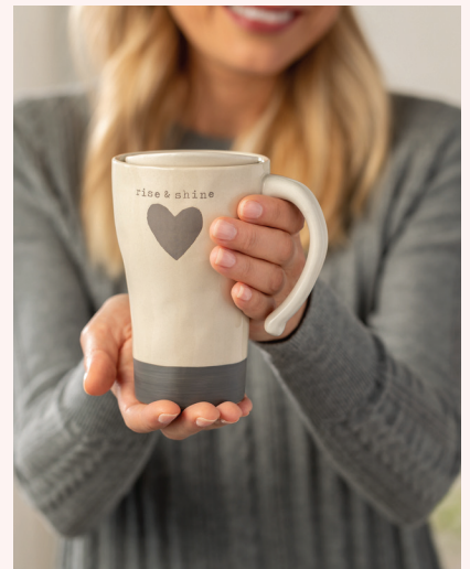
DEMDACO | C996