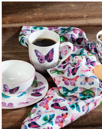
Abbott Collection, shown by Next Step Reps | C863, C888, C891