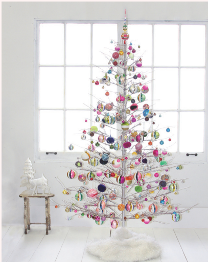
Cody Foster, shown by Keena | C1035, C1053