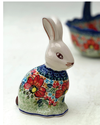
Pottery Avenue | C1112L