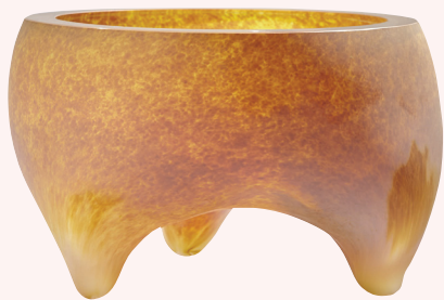
Studio A Home | A153, A154