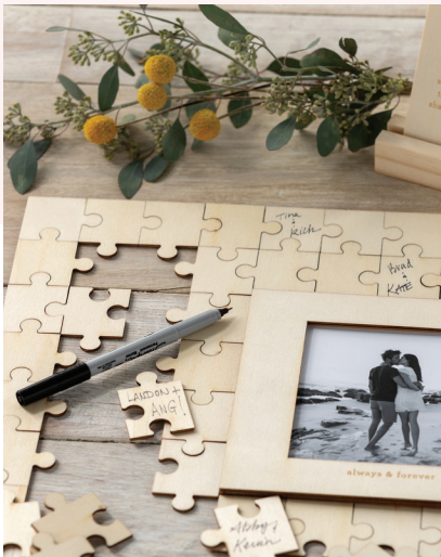
DEMDACO | C996