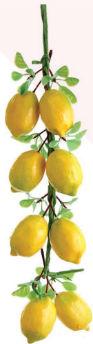
Kurt S. Adler | C812