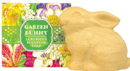
Greenwich Bay Trading | E-313