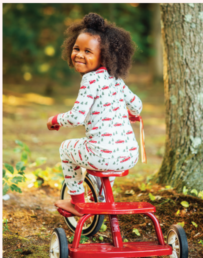
Pajamas for Peace, shown by Lola Jo Sales Group | E-1020