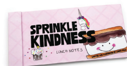
Papersalt USA, shown by Next Step Reps | C863, C888, C891