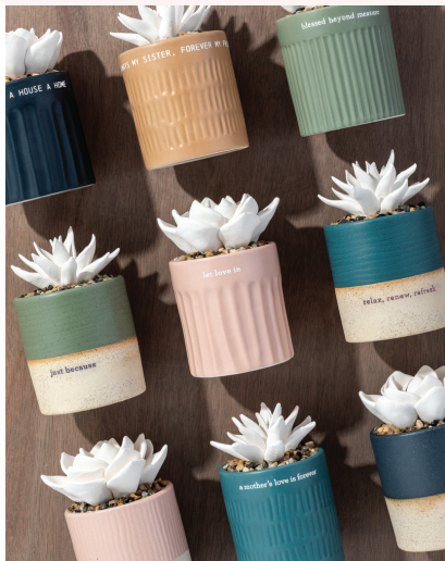
DEMDACO | C996