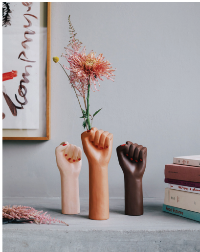
Doiy, shown by Keena | C1035, C1053