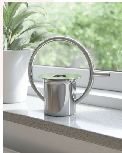
Umbra, shown by Keena | C1035, C1053