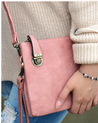
Jen & Co., shown by Next Step Reps | C863, C888, C891