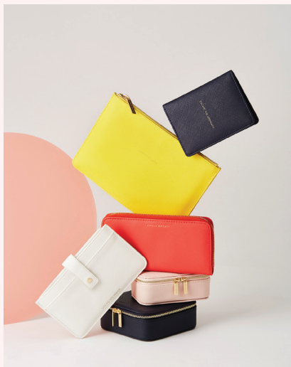
Estella Bartlett, shown by Keena | C1035, C1053