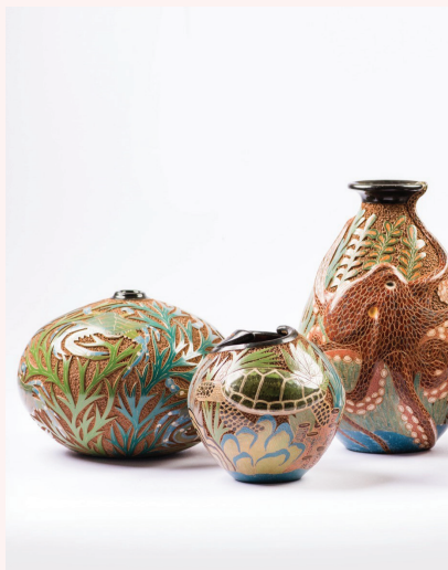
F.T. Renner Company | C777