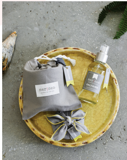
Mer-Sea | C170