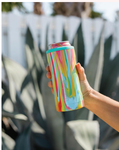
Brumate, shown by Next Step Reps | C863, C888, C891