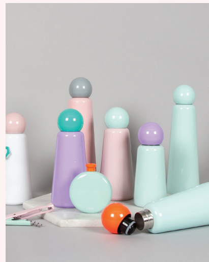
Lund London, shown by Keena | C1035, C1053