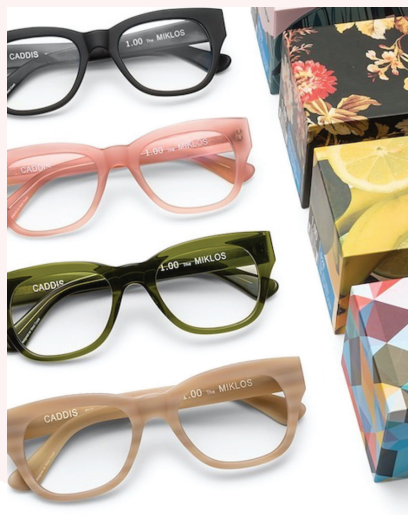
Caddis, shown by Keena | C1035, C1053