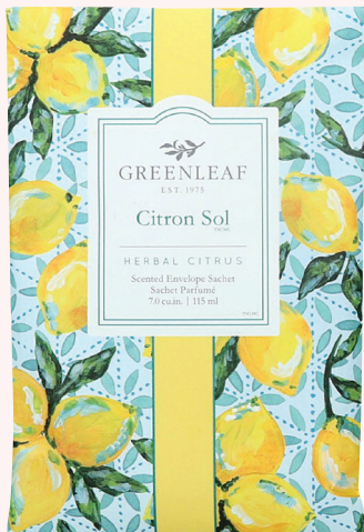
Greenleaf, shown by OneCoast | C801, C804