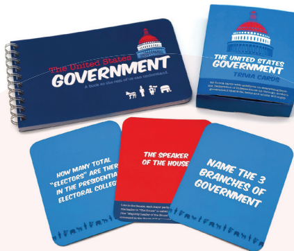
Papersalt USA, shown by Next Step Reps | C863, C888, C891