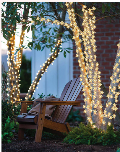
Perfect Holiday | E-857