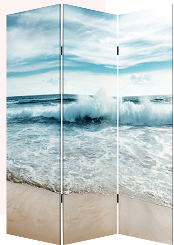
Screen Gems & Teton Home | B105