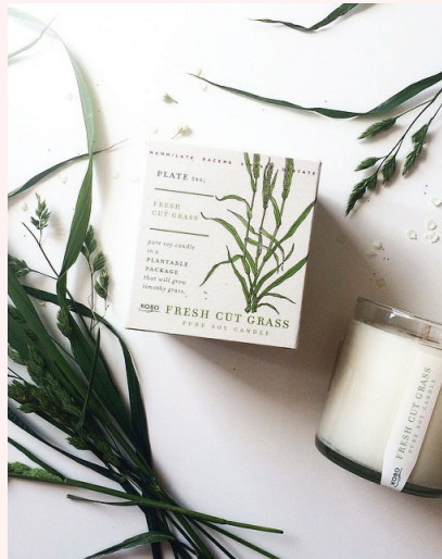
Kobo, shown by Keena | C1035, C1053