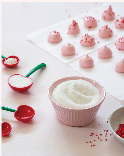
Ototo, shown by Keena | C1035, C1053