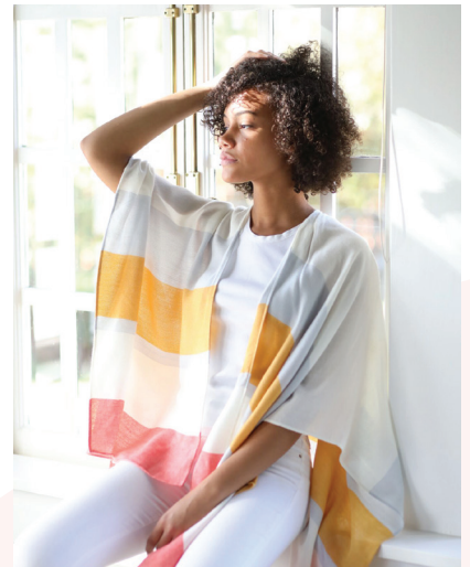
Mer-Sea | C170