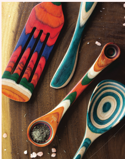
Totally Bamboo, shown by Next Step Reps | C888, C863, C891