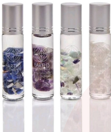
Gifts of Nature | C806