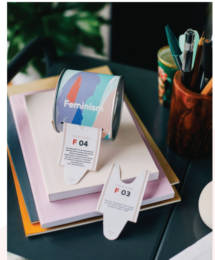
Doiy, shown by Keena | C1035, C1053