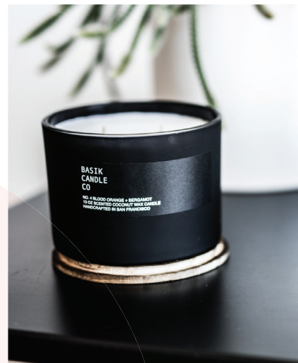
Basik Candle Co., shown by Keena | C1035, C1053