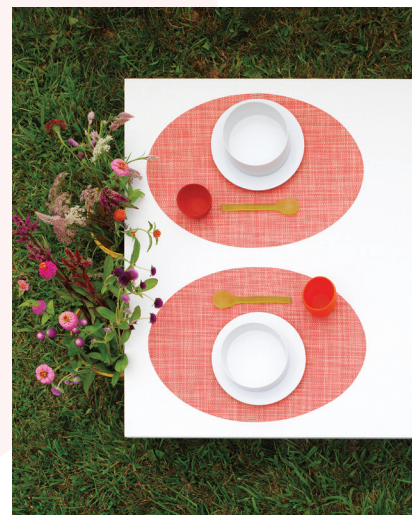
Chilewich, shown by Keena | C1035, C1053