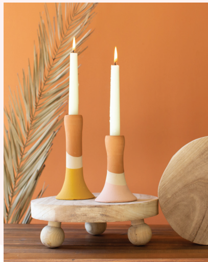
KALALOU | C604