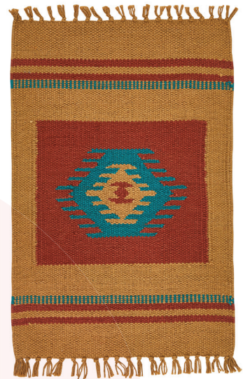
Park Designs | C675